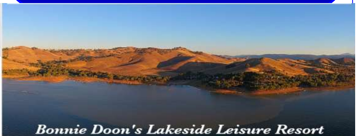
Bonnie Doon's Lakeside Leisure Resort

If you are interested please contact Lorrae on 02 6072 4263 or 0447 724 263 for prices and resort map